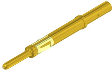
Appearance of 563700 Rev A