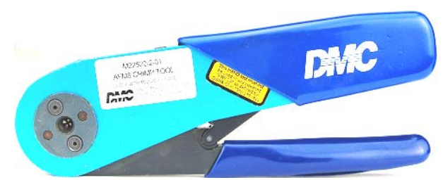
Fig. B. (Crimp Tool M22520/2-01)

STEP 1) From the "Contact Crimp Information" Table, use the crimp tool and Positioner set listed.