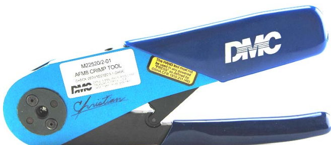
Fig. B. (Crimp Tool M452200/M)

STEP 2) Ensure the selector is set to correct number as listed in "Contact Crimp Information" Table.