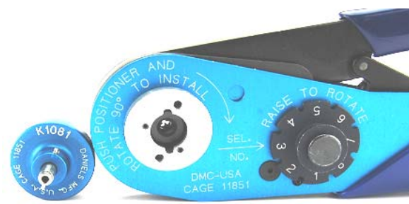
Detail A. (Positioner and Crimp Tool)