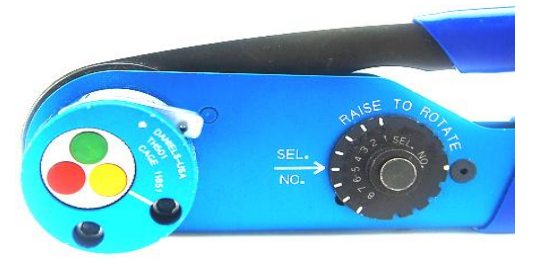
Fig. C. (Positioner inserted into Crimp Tool)

STEP 2) Insert the Positioner into the Crimp Tool as shown in Fig. C. below.