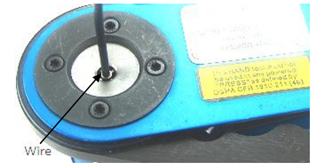
Fig. F. (Stripped wire inserted in Contact)

STEP 6) Inspect crimped assembly for extruding strands of wire to prevent shorts and also check for retention by a Pull and Return Test per IPC/WHMA-A-620A standard (Ch. 19.7.2) to match Fig. H . below.