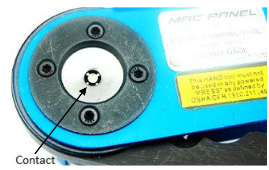
Fig. E. (Contact is Crimp Tool)

STEP 5) Place Contact into Positioner. Insert Stripped end of wire into Contact and crimp as in Fig. E. and F.